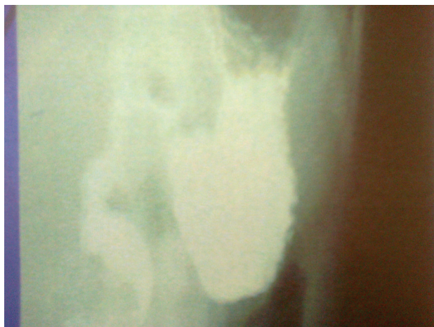
Fig. 1 Upper gastrointestinal series

The upper gastrointestinal series showed an abnormal position of the duodenojejunal junction and the first jejunal loops in the right superior quadrant.