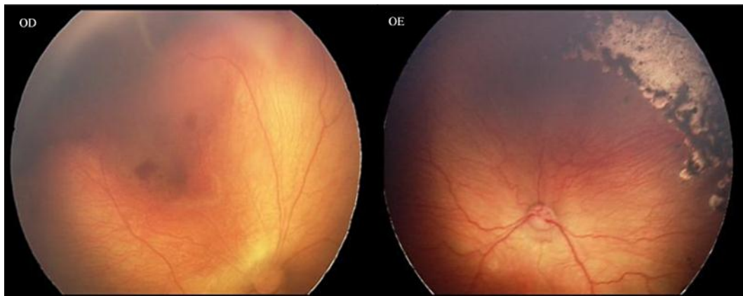
Fig. 4. Two weeks after combined treatment, regression of neovascularization could be observed.