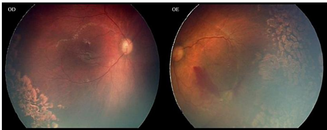
Fig. 2. Total regression of neovascularization could be observed in both eyes after the treatment.