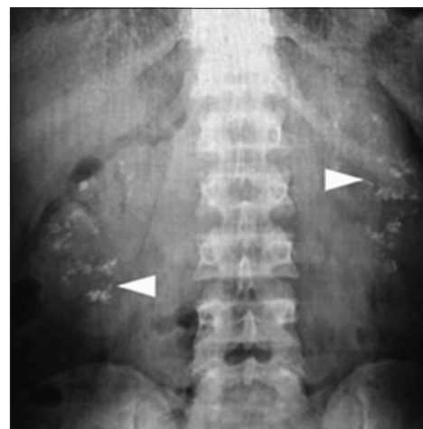
Figure 2: Radiograph of abdomen revealing nephrocalcinosis (arrow) in case of distal RTA