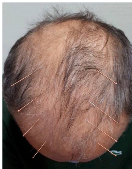
Figure 1. Schematic diagram of the puncture technique <15^\circ and oblique angle puncture direction.

The acupuncture direction was an oblique angle. The puncture technique was <15^\circ shown in Figure 1. The patient was lying in a supine position during the treatment.