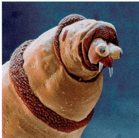
FIGURE 1: Scanning electron micrograph of Lucilia (Phaenicia) sericata . From Fleischmann W., Grassberger M., and Sherman RA Therapy. A Handbook of Maggot-Assisted Wound Healing. Stuttgart: Thieme, 2004:93 pg.

and excretions or ASE), the consequence of which is that digestion begins in the wound bed, outside of the maggot's own body. The necrotic tissue liquefies, and the maggots can then easily imbibe it. The physical movement of the maggot over the wound, plowing the tissue and spreading its ASE as it goes, contributes significantly to the debridement effort. The physical action of the maggot over the wound is a primary reason given by the FDA for classifying medicinal maggots as a medical device and not a simple drug.