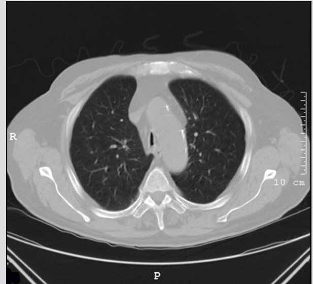
Figure 2. Cross-sectional CT image showing the lateral walls collapsing inside the lumen

Flexible bronchoscopy showed a U-shaped trachea with the upper and lower thirds closed and deviation to the right of the middle third, with partial collapse of the left wall on expiration and coughing, causing a 60–70% decrease in lumen cross-sectional area, compatible with tracheomalacia, and collapse of right and left main bronchus walls on exhalation, with a decrease in lumen cross-sectional area of 30–40%. This case was discussed with an interventional bronchology centre which agreed to endotracheal stent placement. At the time, the patient was in an intermediate intensive care unit on non-invasive positive pressure ventilation (NIPPV). Rigid bronchoscopy under jet ventilation showed small tracheal nodules, which were biopsied, and also revealed a saber-sheath trachea in the middle and lower thirds (Fig. 3), without significant obstruction or collapse and, therefore, no indication for tracheal stent placement.