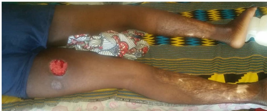
Fig. 1 Scarring lesion and progressive ulceration

PG is a dermatosis that can occur in isolation. However, in more than 75% of cases, it is associated with an underlying pathology, including inflammatory bowel disease; endocrine, hematological, and rheumatological disorders; and nonhematological neoplasia [4]. Few cases of PG related to colorectal cancer have been described. Those that have been reported have been either a single skin lesion located on the trunk or the upper limbs for some [7–9] or ulcerative colitis that was associated with rectal cancer, which made a direct causal relationship between rectal cancer and PG questionable [10]. Cailhol et al. [11] described a cutaneous (lower limb location) and extracutaneous (lung location) PG with secondary appearance during neoplastic progression after the first line of chemotherapy. Our patient's case is distinguished from previous cases by its premature appearance before the diagnosis of adenocarcinoma without any other