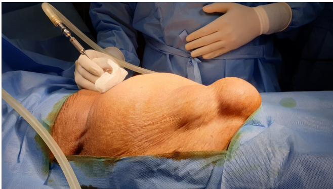
Figure 2 Hernial orifice filling with CO 2 after insufflation with veress needle.

at first primarily with 1-polypropylene followed by closure of inguinal defect with interrupted 1-polypropylene sutures as depicted in figure 4 .