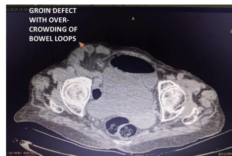
Figure 1 CT image depicting groin defect with overcrowding of bowel loops.

On a diagnosis of obstructed inguinal hernia, patient was posted for diagnostic laparoscopy and proceeded. After insufflation and creating pneumoperitoneum figure 2 , overcrowding of small bowel loops was seen in right inguinal region and pelvis with localised bilious collection of 50 mL in favour of early perforative peritonitis. On releasing the adhesions and bowel loops, a 3×3 cm defect was noted in the right inguinal region with viable bowel loops. On further release, 1.5×1.0 cm defect was noted in the obturator canal with perforation of entrapped bowel loop of Richter's type seen. Laparotomy was done and a 1 cm perforation in terminal ileum with unhealthy edges was noted 20 cm from ileocaecal junction as seen in figure 3 . Thorough lavage was given. Perforation site resection and anastomoses were done in two layers. Anatomical repair of both the defects was done. Obturator defect was closed