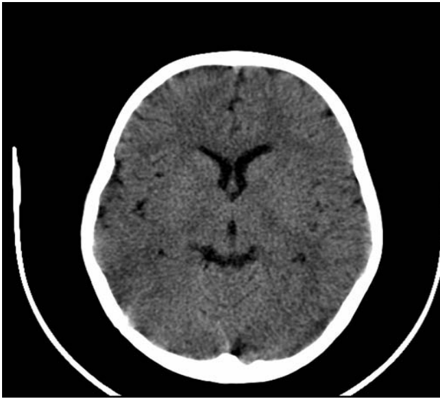
Figure 2 CT brain reveals multiple areas of abnormal hypodensity in the subcortical white matter of both hemispheres.

just at the central sulcus in keeping with the effects of hypertensive encephalopathy ("PRES").