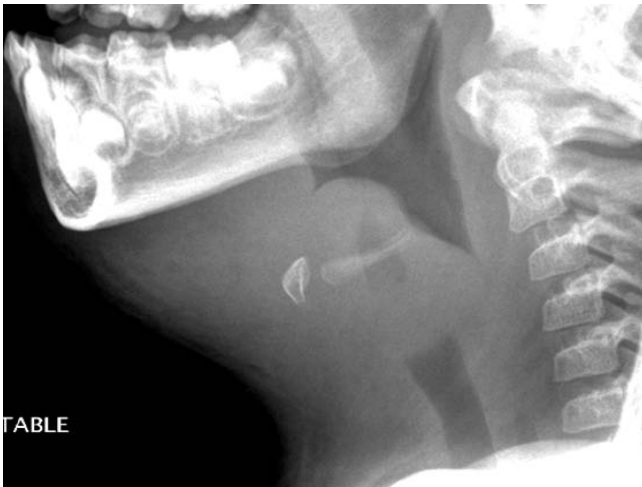
Figure 1 A lateral neck radiograph demonstrates a profoundly swollen epiglottis and complete airway obstruction.

resonance imaging (MRI) brain demonstrated extensive T2 signal changes throughout the white matter with diffuse cerebral edema involving both cerebral hemispheres (Figure 3). A diagnosis of probable posterior reversible encephalopathy syndrome (PRES) was made.