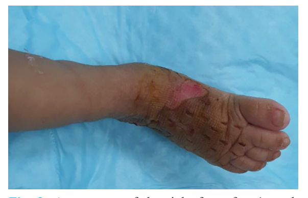
Fig. 2: Appearance of the right foot after 1 week showing almost complete resolution with a small area of desquamation on the medial aspect which healed conservatively.