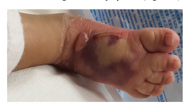
Fig. 1: Extravasation injury of the dorsum of right foot following 10% dextrose IV infusion.

The dressing was repeated every day for a week, and after that, the patient was transferred to another facility and unfortunately was lost to follow up. Based on the clinical features, we can grade extravasation injuries as mild, moderate and severe, which will guide us in managing these injuries (Table 1). We have proposed an algorithm in the management of extravasation injuries based on the grade of injury too (Figure 3).