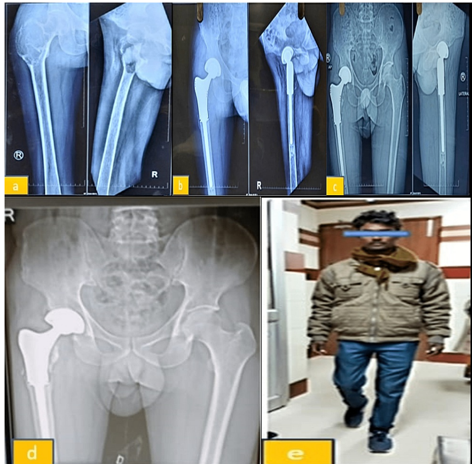
FIGURE 4: The bone growth around the mega prosthesis. (a) X-ray of the right proximal femur GCT (Enneking's stage IIA). (b) X-ray of the right proximal femur at three-month follow-up. (c) X-ray of the right proximal femur at 2.5-year follow-up. (d) X-ray of the right proximal femur at three-year follow-up showing new bone formation at the calcar of the endoprosthesis. (e) Patient photograph while walking at three-year follow-up.