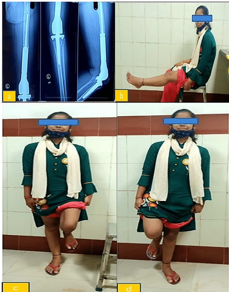
FIGURE 2: Outcome of limb salvage surgery for osteosarcoma of the distal femur with hinge knee mega prosthesis. (a) X-ray of the left limb following limb salvage surgery for osteosarcoma of the distal femur with hinge knee mega prosthesis at two-year follow-up. (b) Full extension of knee in the left prosthetic limb. (c) Standing on the normal right leg with 90-degree flexion in the left prosthetic limb. (d) Standing on a prosthetic left limb with 90-degree flexion in the normal right leg.

The overall mean MTSS score after LSS was 25.0 \pm 4.3 ranging between 12 and 29. The mean MTSS score after LSS for proximal femur tumour was 25.0 \pm 4.8 , for distal femur tumour, the mean MTSS score after LSS was 26.6 \pm 1.4 and for proximal tibia tumour, the mean MTSS score after LSS was 16.5 \pm 6.4 . During follow-up, local recurrence along with inguinal lymph node metastasis was observed among 7.1% of subjects, and multiple vertebral metastases were observed among 3.6% of subjects (Table 5).