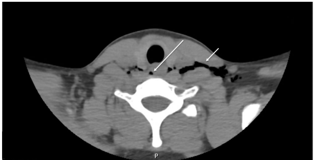
FIGURE 3: CT of the neck demonstrating subcutaneous emphysema (hypodense gas denoted by the right white arrow) and retropharyngeal emphysema (hypodense gas denoted by the left white arrow)

Over two days, the patient was given scheduled albuterol, a prednisone taper, and baclofen (for