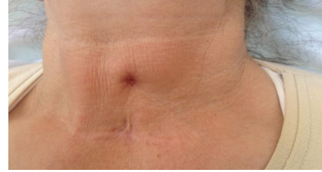
FIGURE 1: Cutaneous sinus located superior to the thyroidectomy incision.

Local pain and minor hematomas are the most common clinical complications. Most hematomas are self-limiting and do not cause serious problems [7, 8]. Post-FNAB hemorrhage and fibrosis are the most common histological alterations observed in surgical specimens [9]. In the literature, there are a few reports regarding subcutaneous nodule formation due to malignant cell implantation after FNAB, and this was accepted as a rare cause of thyroid cancer recurrence [10]. Besides, other rare complications have also been reported as case reports. These are intrathyroidal massive hemorrhage and upper respiratory tract congestion [11], nodule infarction [12], recurrent laryngeal nerve palsy [13], tracheal injury related hemoptysis, thyrocuteaneous sinus formation [14], and pleural injury resulting in pneumothorax [15]. Recent studies showed that using USG guided FNAB has significantly decreased the ratio of insufficient cytology reports comparing to the palpation guided FNAB [16–18]. Although palpation guided FNAB continues to be a successful approach to the evaluation of palpable lesions, ultrasound guided FNAB enhances precision, documentation, and diagnostic yield in nonpalpable and even in palpable masses.