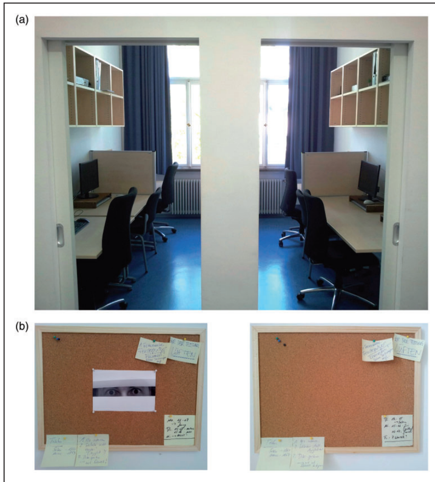
Figure 1. The test setting: View into the two test cabins (a), and photographs of the pin boards (b) that were fixed at the walls above the test places in the left (eyespot-present) and right cabin (eyespot-absent), respectively.