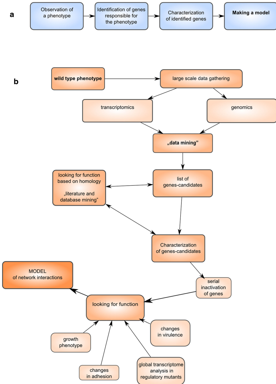
Fig. 1 Differences of experimental approach between classical (a) and experiments involving high-throughput analyses such as NGS (b)

bioinformatic tools (Feist et al. 2009). Because multiple bacterial species are not as well studied as E. coli , they usually contain a large percentage of genes of unknown function