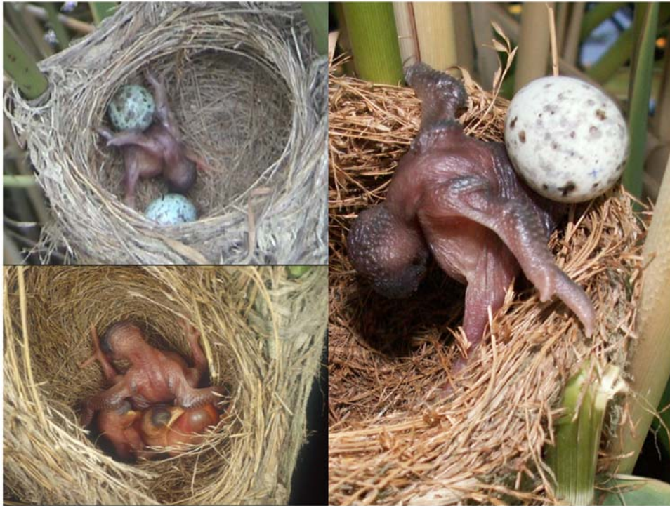
Figure 1. Hatching common cuckoos in the process of evicting host eggs and chicks from great reed warbler nests. doi:10.1371/journal.pone.0007725.g001

cohabit with host nestmates, they would face permanently costly competition for foster parental care [15] and suffer from lower growth [5,6,15] or very high mortality [5,16]. Therefore, the window of virulence by cuckoo parasites appears to be open only briefly after the cuckoo chick hatches [12].