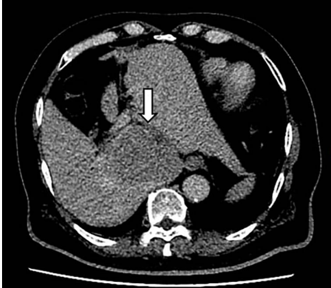
Figure 1: CT scan axial section delayed phase showing a 3.2 × 3.0-cm lesion (arrow) with early washout in Segment I of liver, consistent with hepatocellular carcinoma.