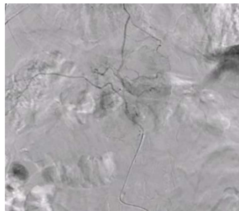
Figure 4: Superselective delayed phase angiogram of right renal artery using microcatheter showing well-defined tumor blush.

[3, 4]. Further, prior abdominal surgery or a history of ruptured HCC are other important risk factors for development of extrahepatic circulation [5–7]. It is noteworthy that our patient did not have any of the above-mentioned risk factors. Importantly, the HCC lesion in our patient, located in Segment I, was only 3.0 cm × 3.2 cm in size.