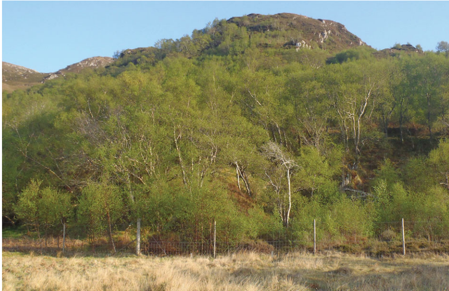
Figure 2. Woodland regeneration projects often incorporate exclusion fences for deer to reduce browsing.

the impact of deer management methods and, when deer numbers were reduced through culling or fencing, there were dramatic declines in the tick population. For example, a study examining I. ricinus tick density in response to deer management methods reported reductions of 73% on heather moorland and 94% in woodlands due to culling, and 86–88% due to fencing moorlands and 96% reductions due to fencing woodlands [12].