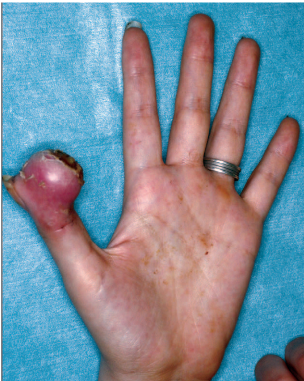
Fig. 1. Clinical findings of ancient schwannoma. An indolent, hard but elastic, immovable skin tumor of 30×25 mm is present on the palmar aspect of the distal phalanx of the left thumb.

Total excision of the tumor was subsequently performed with digital nerve block under surgical microscope. Despite adherence to the ulnar aspect of