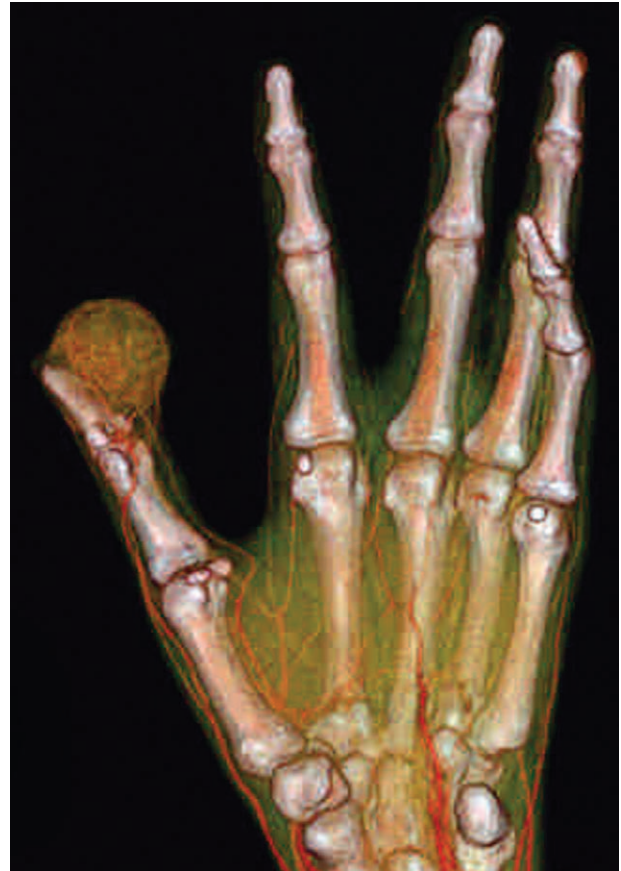
Fig. 2. Multidetector computed tomography findings. The tumor shows poor vascularization but no adherence to the surrounding bone.

the distal digital nerve, the tumor was excised without injuring the nerve. Skin defect was reconstructed by grafting with artificial dermis.