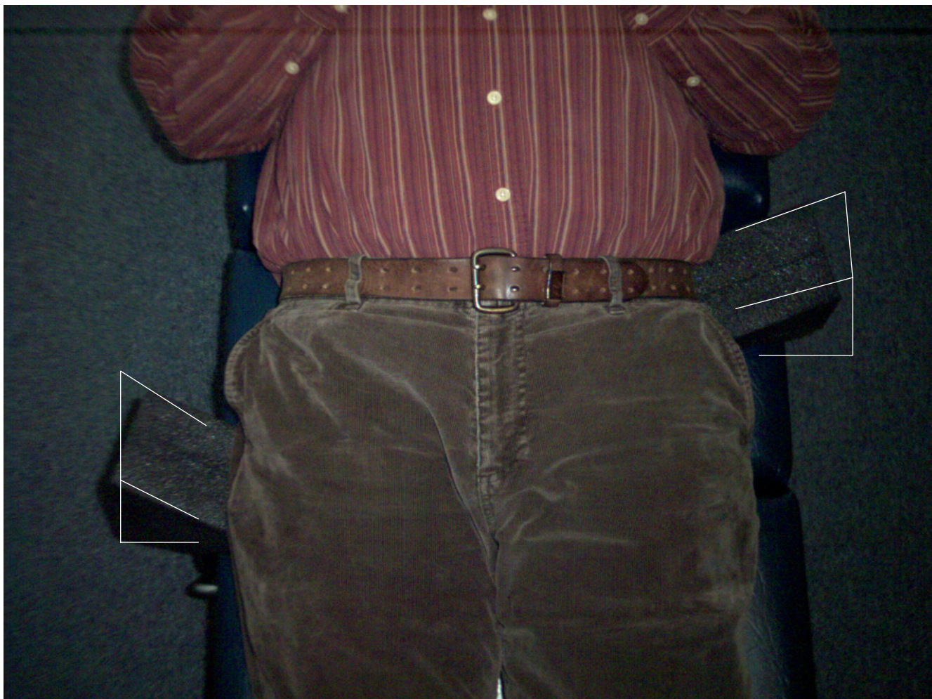
Figure 2 This picture shows the placement of the pelvic blocks for an anterior right ilium. The blocks are placed opposite of the pelvic rotation.

all average reduction of 17°. Every patient made at least a 25% improvement. The largest improvement measured 33°, and the smallest improvement measured 8°. Table 1 shows the results of all 19 patients that followed through with the entire treatment plan. Figure 5 is a sample of the improvements made by a few of the patients.