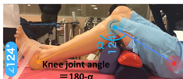
Fig. 1. Measurement of knee joint angle using a smartphone application.

Thus, the 12 examiners measured the eight knee joints using both the APP and a UG, resulting in 96 pairs of paired data. Correlations between the APP and UG measurements were examined by obtaining scatterplots and correlation coefficients. Accuracy was examined by visually confirming the systematic errors of the APP using the Bland-Altman method 12 ). We also evaluated the inter-examiner reproducibility of the APP and the UG by calculating the intra-class correlation coefficients (ICC).