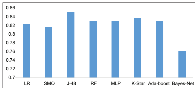
Figure 2: The comparison of the F-Score of the different data mining algorithms

Today, COVID-19 disease has become a universal problem that has endangered the health, social, economic, and developmental conditions of many countries; thus, WHO in its report has identified the disease as a serious threat to community health. [21,22] In such circumstances, the need to use new and advanced technologies to monitor disease trends, track contacts, and identify the disease's patterns as well as to prevent, screen, treat, and monitor the patients has become more realized. [23,24] To counter this threat to public health, many countries have emphasized the need to use technological infrastructure. [25] During the COVID-19 epidemic, the promotion of public health potential in the fight against coronavirus requires attention to the fact that the cause of problems and risks threatening public health, as well as solutions to these problems must follow a complex technological adaptation system. [26] The digital health technology revolution in the early 2020s was marked by the epidemic of coronavirus due to the widespread use of