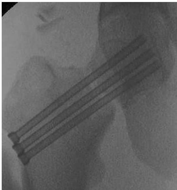
Fig. 2 X-ray showing fracture fixation with three cannulated screws ( AP view )

increase to full weight bearing by 3 months. At 6 months, he was fully weight bearing and completely pain-free. A repeat CT scan confirmed bony union (Fig. 6).