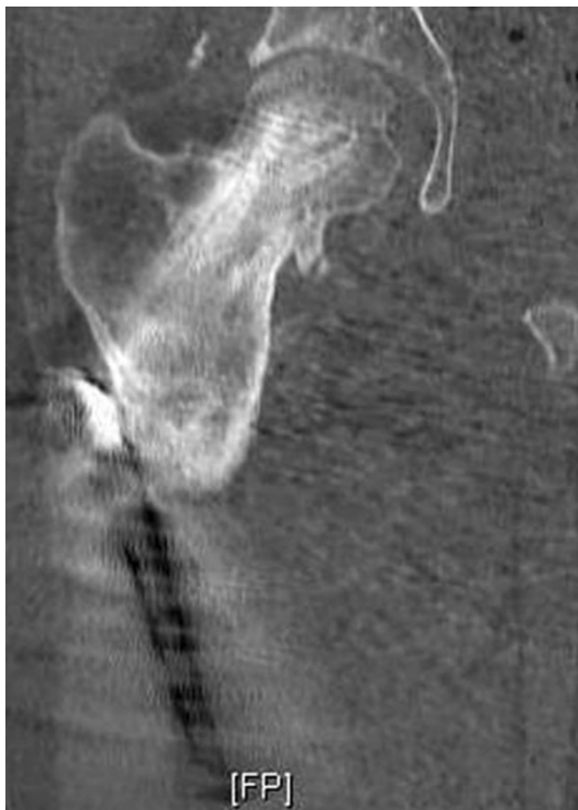
Fig. 6 CT scan showing united fractured neck of femur ( coronal cut )