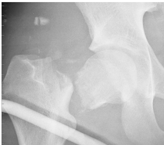
Fig. 1 X-ray showing vertical shear intra-capsular fractured neck of femur with comminution ( AP view )