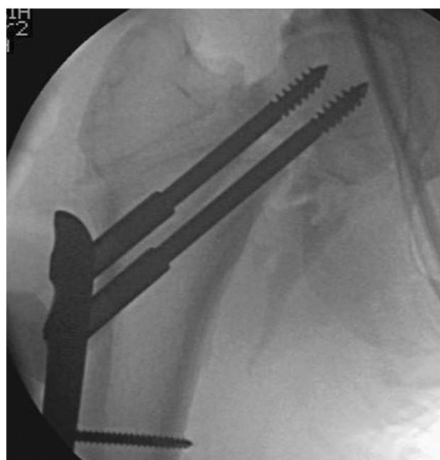
Fig. 4 X-ray showing PC.C.P. in situ intra-operatively ( AP view )

A non-union of an intra-capsular fracture of the femoral is difficult to treat in a young adult [1–5]. The principles of