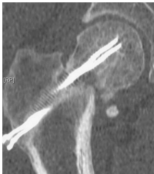
Fig. 3 CT scan showing non-union at the fracture site ( coronal cut )