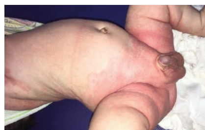
Figure 4. Tinea incognito masquerading as diaper dermatitis.