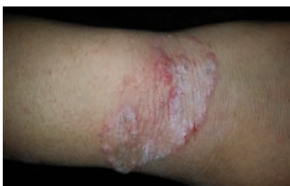
Figure 2. Tinea incognito resembling psoriasis.