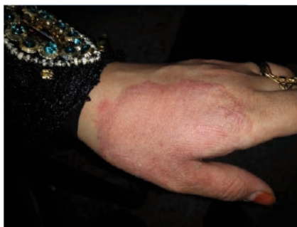
Figure 1. Tinea incognito involving the hands and nails masqueraded as acute or chronic eczema.

Over the last three years, we were able to see a large number of cases of tinea incognito in both private and hospital settings, with a diversity of clinical presentations. Undisputedly, there has been an increase in the frequency of tinea incognito in our community over the last few years. This may be correlated with malpractice in the field of dermatology, where there was a misdiagnosis of initial fungal infections and, therefore incorrect prescription of topical immunosuppressive agents by unaware physicians. Initially, these medications suppress the normal cutaneous immune responses to dermatophyte, thus enhancing the development of fungal infections. 6,7 In our study, the majority of patients were females (64%), while 36% were males. Despite the previous reporting that the infection rate of dermatophytic fungus was higher in males as compared to females, 8 Iraqi women were more likely to misuse topical steroids than men. This finding was in contrast to other studies. 2,10-14 Besides the misapplication of topical fluorinated steroid in most cases, a preparation containing a mixture of potent steroids with antifungal and antibacterial agent (mixed drug combinations) was also used. In the latter case, the potent steroid overcomes the effect of the anti-fungal agent, thus exacerbating superficial dermatophytoses. 9 Such combinations are irrationally sold as an over the counter medications without any prescription. Similarly, an outbreak of tinea incognito in