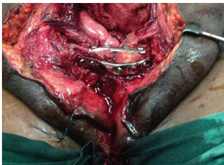
FIGURE 4: Image showing plated pelvic fracture after reduction and repair of bladder and pelvic floor.

predisposing factors to eversion and prolapse of bladder. Other reported causes of bladder eversion and prolapse in human were pulling out of Foley's catheter [12] and bladder eversion concurrent with uterine prolapse [13] and primary adenocarcinoma [14]. Trauma as a cause of bladder eversion and prolapse as seen in this case is not widely reported. We could not find in the literature search any of such occurrences secondary to severe pelvic injury. However, isolated bladder rupture or tear without prolapse is a common complication of high-energy events [15].