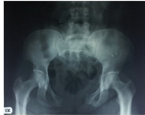
FIGURE 2: Pelvic X-Ray showing wide pubic diastasis, fractured left upper ischial ramus, and widened sacroiliac joints.

patients with a traumatic bladder rupture have an associated pelvic fracture [4].