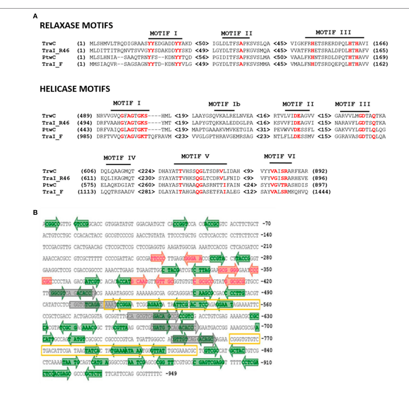
FIGURE 1 | Conserved motifs in PtwC and related proteins and features of the hypothetical oriT region. (A) Conserved motifs in the relaxase and DNA helicase domains, with the most conserved residues highlighted in red. (B) Features in hypothetical Ptw oriT region (coordinates 66.438–65.490 in Accession number NC_011003.1). IRs with one mismatch are represented in green. A set of DRs of 15 bp with three mismatches are represented in gray. High AT regions are marked with a yellow box.

identity. The most likely region to contain the Ptw oriT sequence would be in a 949 bp intergenic region located upstream of ptwA . It contains DNA segments with high AT content (squared regions in Figure 1B ), candidates to contain the nic site, and two times more IRs than in a randomly selected intergenic region of the same size (not shown), especially in the region including the two AT-rich DNA segments ( Figure 1B ). All these features lead us to propose this as a candidate region to contain the Ptw oriT .