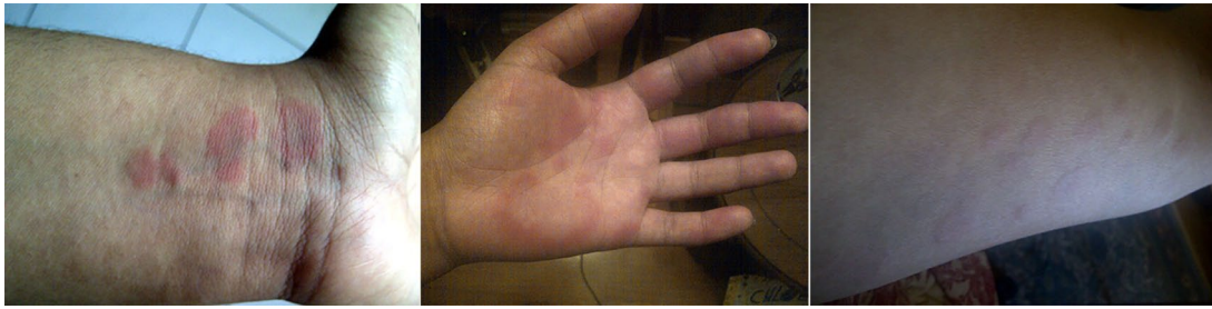
Figure 1. Urticarial vasculitic skin lesions of forearm, palms, and thigh.