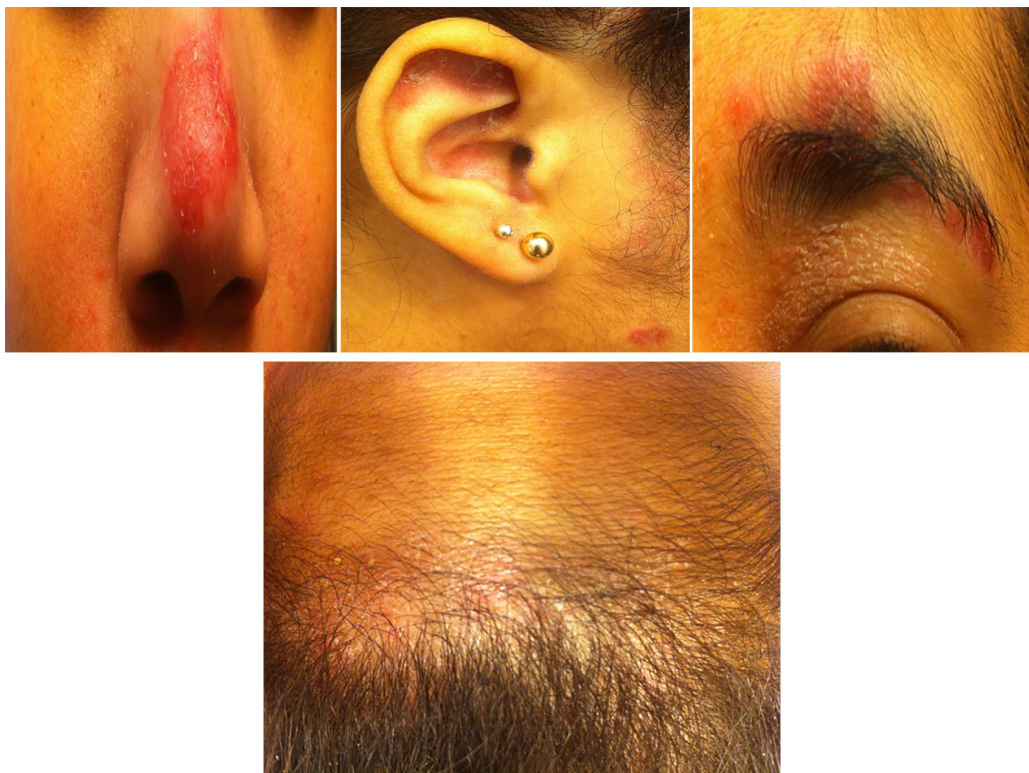
Figure 3. Discoid lupus erythematosus of nose, ear, around eyebrow, and scalp.