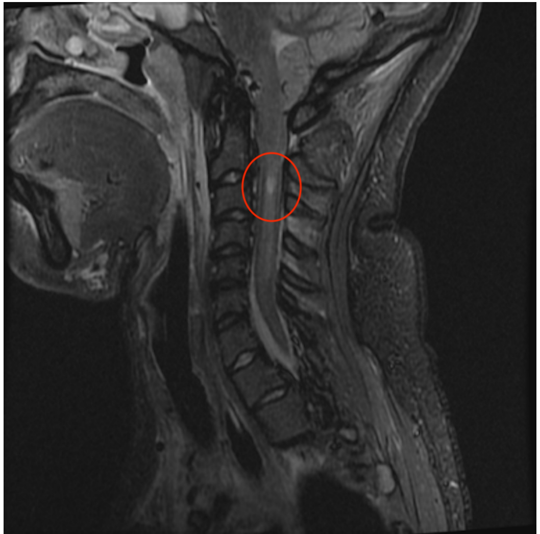
FIGURE 4: Magnetic resonance imaging (MRI).

MRI brain showing resolved presyrinx along with cerebrospinal fluid (CSF) in premedullary region.