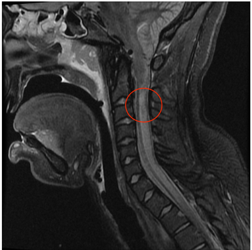
FIGURE 1: Magnetic resonance imaging (MRI).

An 18-year-old female status post normal vaginal delivery with epidural analgesia two months prior presented to the emergency department (ED) with intermittent headaches, diplopia, nausea/vomiting and cachexia since given birth. She denied prior history of headache. Shortly after arrival to the ED, she became unresponsive and developed flaccid quadriparesis with complete ophthalmoplegia. She was unable to protect her airway and required intubation. Computed tomography (CT) head showed complete basal cistern effacement with 2 cm cerebellar tonsillar herniation into the foramen magnum. Raising the head of the bed caused acute bradycardia and hypotension. She was subsequently given mannitol and required prolonged Trendelenburg positioning to maintain a goal mean arterial pressure (MAP) of 80-100 mmHg. She was not a candidate for decompressive surgery given her hemodynamic and neurologic instability. Magnetic resonance imaging (MRI) of the brain and spinal cord revealed a syrinx at C4 and pre-syrinx extending down to T2 along with cervical spine venous engorgement and cerebrospinal fluid (CSF) flow obstruction at the level of the foramen magnum (Figure 1).