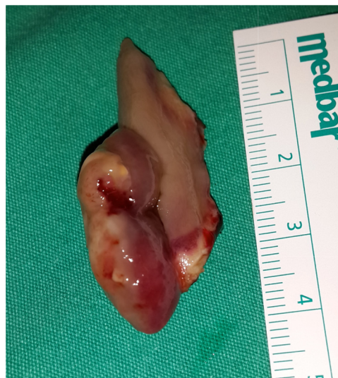
Figure 3 Excised mass; lobular, red-grayish, about 30 mm long and 10 mm diameter.

30 mm in length, and 10 mm in diameter (Fig. 3). There were no serious bleeding intra or post-operatively. After removal, the material underwent histopathological examination. After 24 h, the patient was discharged without any complication. Oral antibiotic was prescribed for seven days.