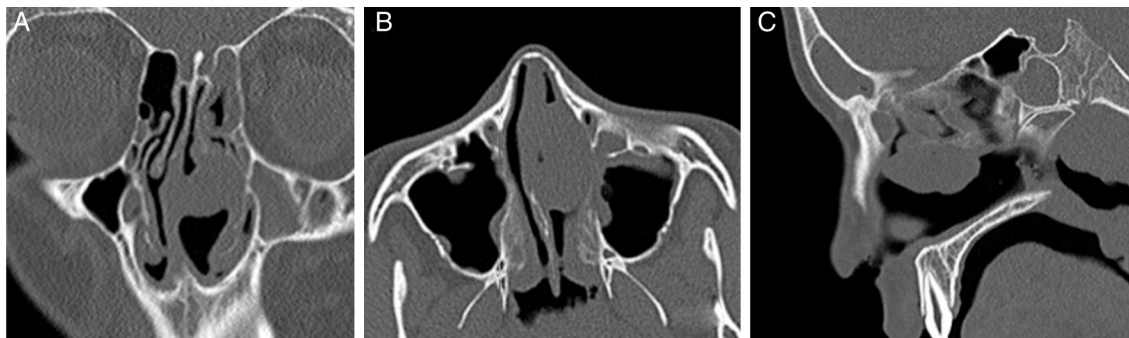
Figure 2 Intensely enhanced homogenous mass lesion originating from the left middle turbinate on coronal (A), axial (B), and sagittal (C) computed tomography images.

Primary extranasopharyngeal angiofibromas have rarely been reported. Unlike the classic juvenile angiofibromas, extranasopharyngeal angiofibromas are more frequently seen in an older age group and more commonly in females. Our case in a 13 year old male is very unusual according to the medical literature knowledge. Primary extranasopharyngeal angiofibromas most commonly