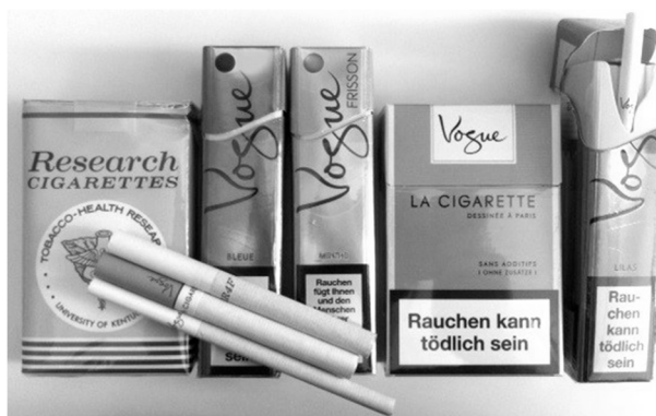
Figure 1. Design of the cigarettes and cigarette packets of the investigated cigarettes.