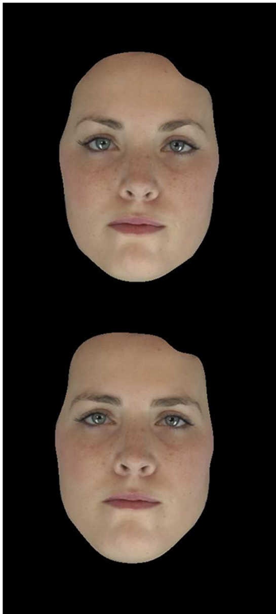
Figure 1. Example of feminized (top) and masculinized (bottom) facial stimuli. Note. Frame extracted from video stimulus. Participant provided written informed consent for the publication of this photograph.

Audio files were extracted as WAV files using Adobe Premiere Pro. We manipulated voice pitch using the pitch synchronous