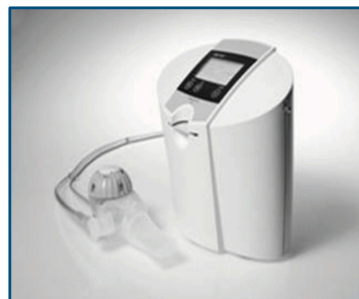
Figure 2 Examples of novel marketed nebulizers. Examples of the different types of commercially available nebulizers that incorporate newer aerosol generating technologies. PARI LC® Sprint (PARI, USA 83 ); SideStream Plus® (Philips, USA 84 ); AeroEclipse® II (Monaghan Medical Corporation, USA 85 ); Micro Air® NE-U22 (Omron Healthcare, USA 86 ); AKITA2® APIXNEB (PARI Pharma GmbH, Germany 87 ).

(FEV 1 ) when compared with placebo. 44,45 No significant differences were observed between these two treatments in terms of efficacy, cost, occurrence of AEs, or hospitalizations. 46 With regard to nebulized SAMAs, nebulized ipratropium demonstrated significant improvements in FEV 1 within 15–30 minutes, which persisted for 4–5 hours. 47 Furthermore, clinical studies of dual ipratropium-albuterol have demonstrated improvements in FEV 1 versus both albuterol or ipratropium alone. Ipratropium-