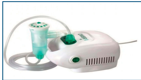
AeroEclipse® II (Monaghan Medical Corporation, Plattsburgh, NY)