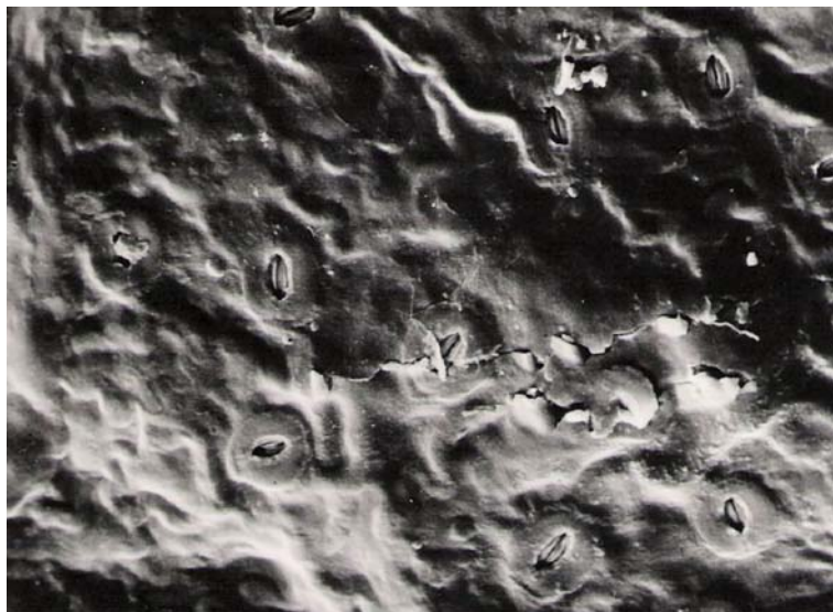
FIGURE 2. Degraded structure of epicuticular waxes, European beech, Vidly, 950 m a.s.l.

The matrix of correlation of individual parameters for European beech (Table 1) shows that, in the beech stands, there is a significant correlation of tree defoliation and stand age. Also, the amount of MDA and epicuticular waxes depends on the altitude. For spruce, there is also a significant correlation (Table 2) of defoliation and stand age, and of epicuticular waxes and the altitude. Even significantly growing O 3 concentration with the altitude is clearly visible. The relation of MDA and epicuticular waxes in between the current year and 1-year-old needles is quite clear. The results of partial correlation confirmed a significant relation in the same cases.