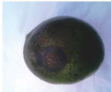
FIGURE 1: Anthracnose symptoms on avocado fruit.

A total of 46 isolates had whitish, greyish, or creamish colour and cottony, velvety mycelium on the top side and greyish cream with circular orange-pinkish colour on the reverse side, Figure 2(a). Their spores were straight with rounded end (Figure 2(b)), typical of C. gloeosporioides [29]. The remaining 34 isolates had whitish grey mycelium with black fruiting structure on the upper side and greyish black