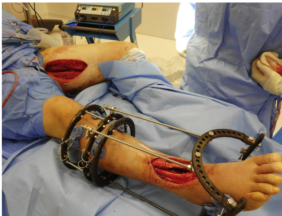
Figure 1 – Orthopaedic surgery for osteomyelitis.

The questionnaire was designed, tested and revised by a multidisciplinary team of clinicians, nurses and patient representatives. It asked about patients' experiences before the operation (Part A) and in the anaesthetic room and theatre (Part B). For those patients who had undergone previous general anaesthesia for surgery for the same condition, a comparison of the two techniques was sought (Part C).