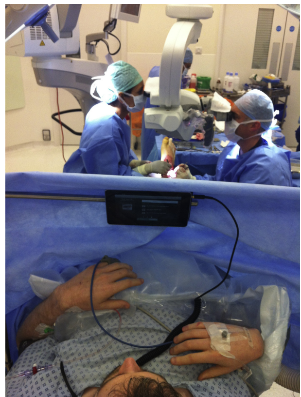
Figure 3 – Intraoperative audio-visual distraction technique.

Of the 50 patients who returned the completed questionnaires, 46 patients received a free gracilis muscle flap, 2