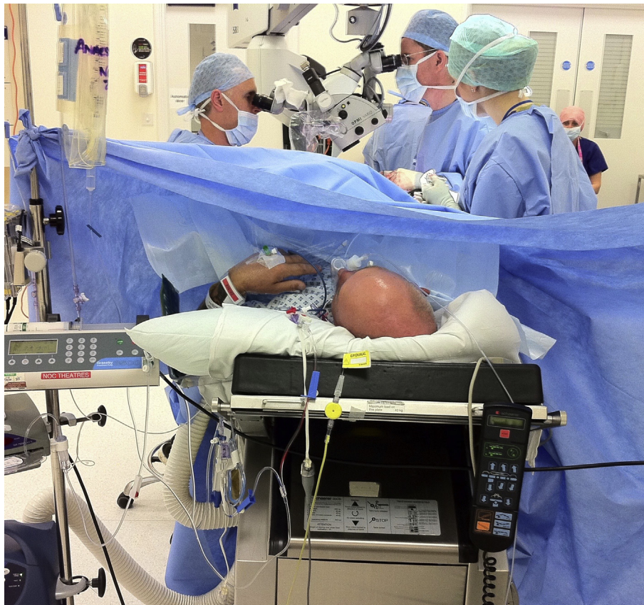
Figure 4 – 14.5 h Orthoplastic operation under continuous Epidural Anaesthesia.

free fibula grafts, 1 vastus lateralis and 1 fasciocutaneous flaps.