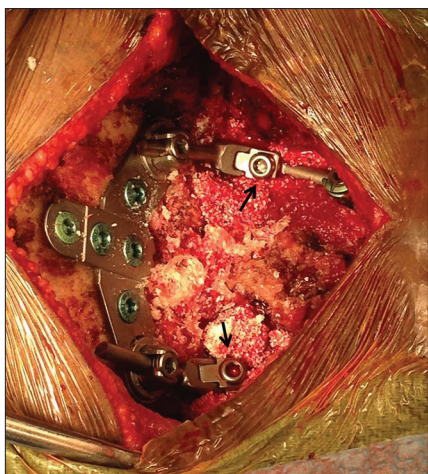
Figure 2: Intraoperative photograph showing occipitocervical arthrodesis using a hinged rod system. Note the location of the hinge (arrow) coinciding with the location of the C1 lateral mass (precluding the placement of a C1 lateral mass screw)