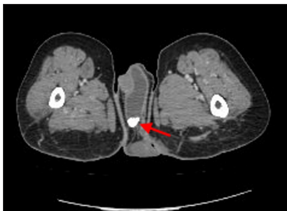
Figure 1. Stone in the fluid-filled scrotal sac (arrow).