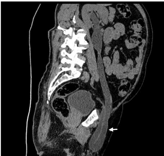
Fig. 1. A plain CT of KUB showing the left ureter coursing into the left inguinal canal, descending into the scrotum, and looping back to enter the bladder (arrow).

search of the literature, we believe that this is the first case to be managed via laparoscopic Trans-Abdominal Pre-Peritoneal Repair and would like to highlight the technical details of the procedure. This case report is presented in line with SCARE-2018 Guidelines [1].