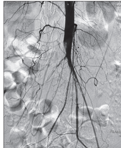
Figure 1: Diagnostic digital subtraction abdominal aortogram through high brachial artery access, showing complete occlusion of the origin of the right common iliac artery

Of the 29 patients who had angioplasty, 4 patients were lost to follow-up within the 6-month post-PTA.