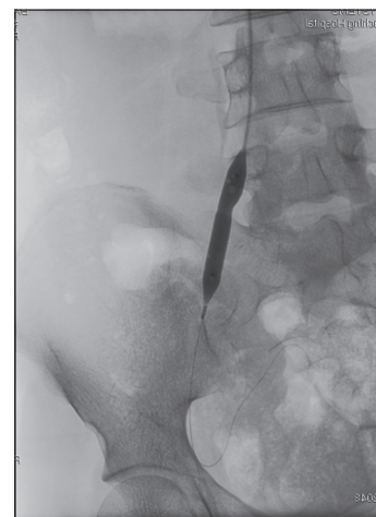
Figure 2: Transluminal angioplasty of the occlusive lesion at the origin of the right common iliac artery