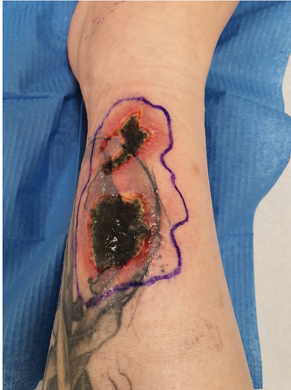
Figure 3. Week 4.

Complications like second and third degree burn injuries are usually described in percutaneous radiofrequency treatment but not with transcutaneous radiofrequency alone. 3