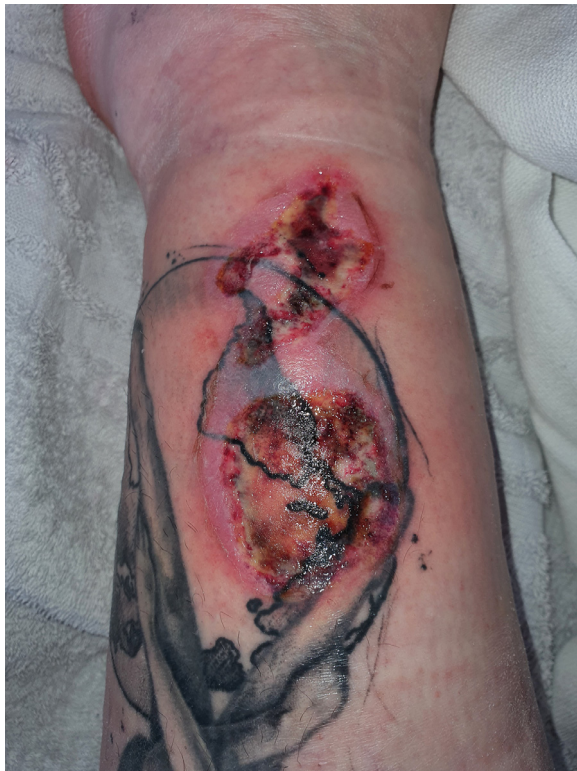
Figure 2. Week 2 after the treatment: deepening of the burn.