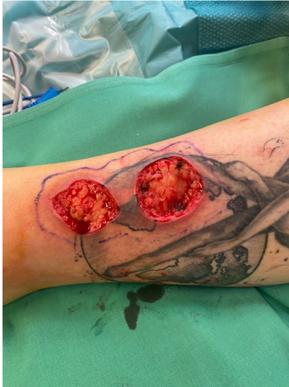
Figure 4. Week: post necrosectomy status in the operating room.

up to leave time for demarcation. 4 weeks post RF both wounds presented with a third degree burn necrosis, requiring debridement in the OR (Figure 4).