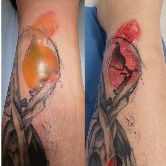
Figure 1. (a) Day 2 after the initial treatment. (b) Day 2 after blisters debridement.