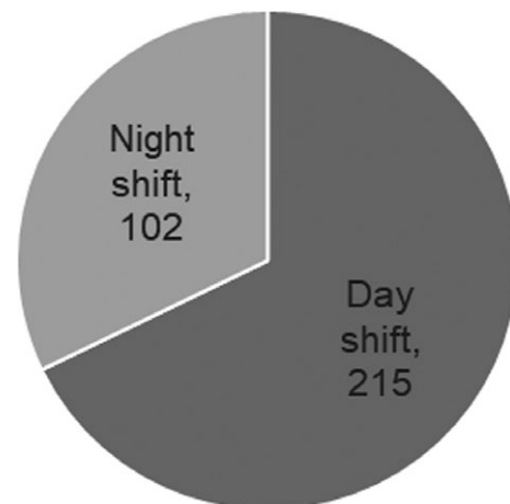
Fig. 2. Proportion of patients treated by doctor-staffed ambulances during the night shift, based on data for the week July 18 to 24, 2016 supplied by 73 Japanese hospitals.

D OCTOR-STAFFED AMBULANCES WERE operated by 133 hospitals in Japan in 2016, and they were