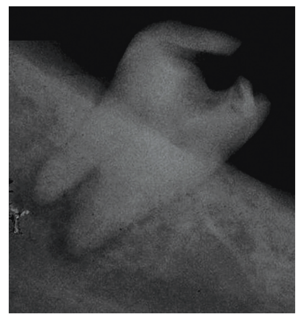
Figure 1. Preoperative radiograph of the right mandibular second molar.

A pre-treatment radiograph was taken, and