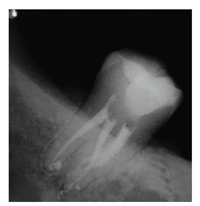
Figure 5. Periapical repair observed 13 months postoperatively.

Endodontic success in teeth with a number and morphology of canals above that normally found