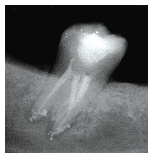
Figure 4. Postoperative radiograph demonstrating the presence of root canal system.