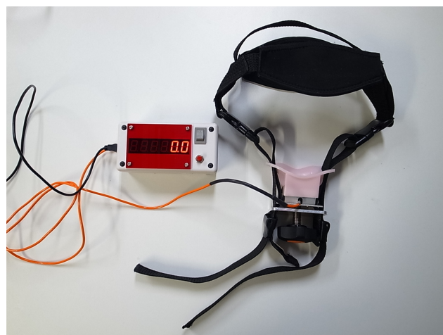
Figure 1 Jaw-opening sthenometer.

A coordinate system was established with the y-axis forming a straight line connecting the lower ends of the second and