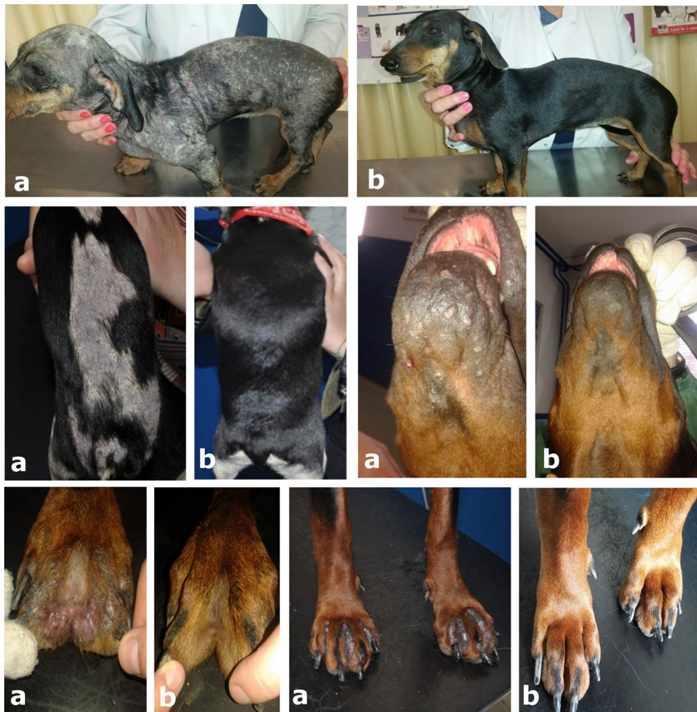
Fig. 1 Multiple photos of a dog with generalized demodicosis showing the clinical condition on a day 0 and b day 56 following fluralaner treatment