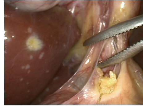
FIGURE 1: White plaques on the liver, noted during laparoscopy.

The authors declare that there is no conflict of interests regarding the publication of this paper.