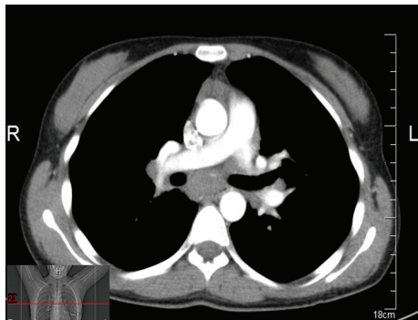
FIGURE 5: Thoracic CT views.