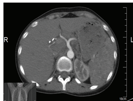
FIGURE 4: Thoracic CT views.