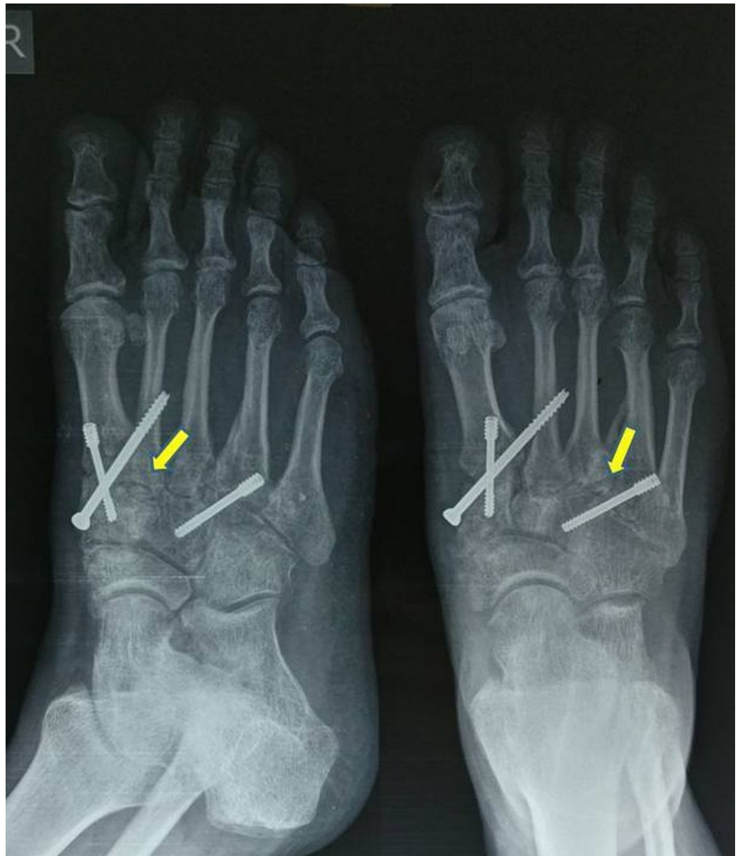
FIGURE 4: Follow-up radiographs at two months

Postoperatively, a below-knee plaster cast was given for a period of eight weeks and the patient was kept non-weight bearing. After two months, the cast was removed after radiological signs of fusion were seen (Figure 4). The patient was then allowed to bear full weight. At the 18-month follow-up, the patient was bearing full weight with no pain, and radiologically there was good fusion of the first, second, and fourth TMT joints (Figure 5).