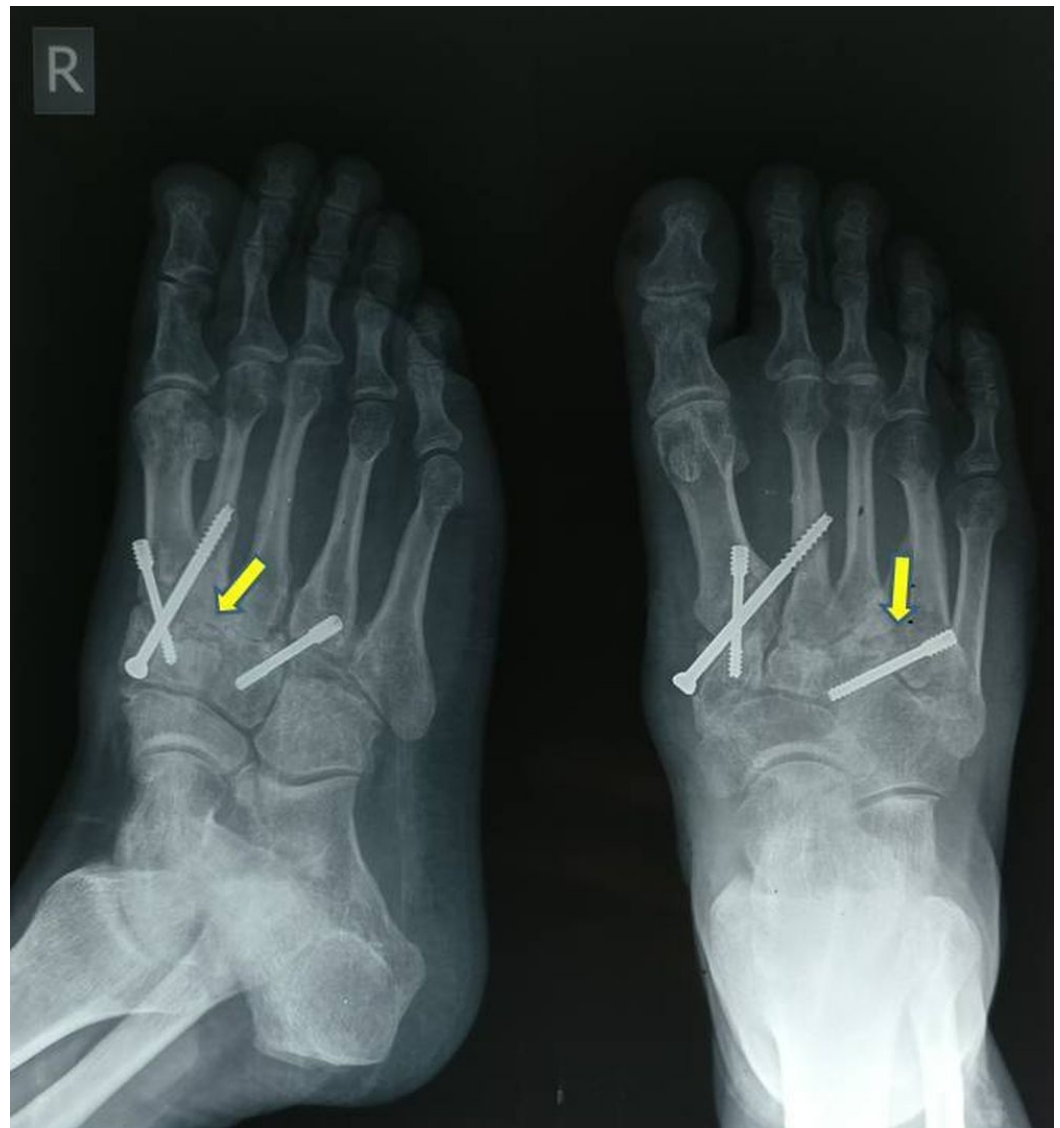
FIGURE 5: Final follow-up at 18 months

Shows good fusion of the TMT joints with screws maintained in position.