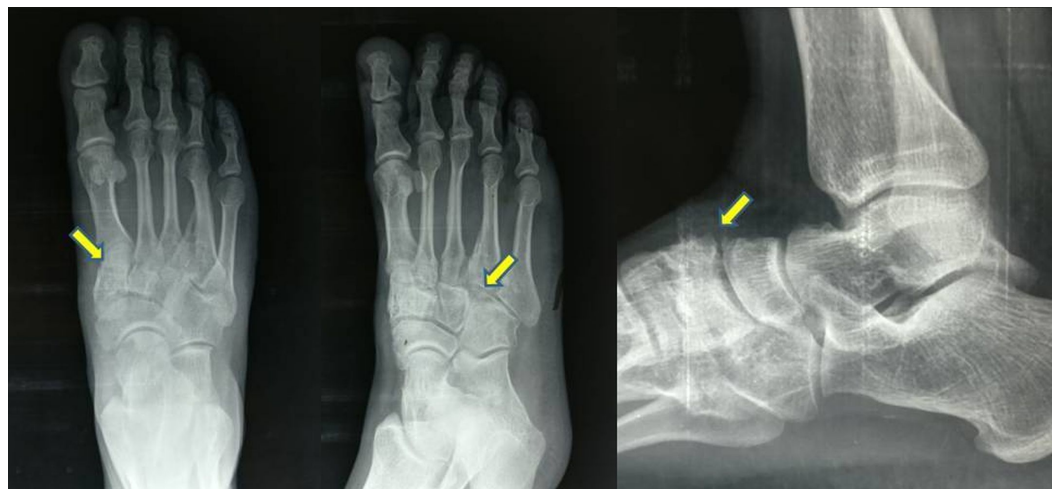
FIGURE 1: Pre-op radiograph (antero-posterior and lateral views)

A weight-bearing antero-posterior (AP) radiograph showed incongruous first and second TMT joints with osteophytes formation with decrease in the joint space and marginal sclerosis of the joints. Lateral and oblique radiographs showed wide displacement of the second and fourth TMT joints with flattening of the longitudinal arch (Figure 1). A computed tomography (CT) showed incongruous joint surfaces with osteophytes around the first, second, and fourth TMT joints (Figure 2).