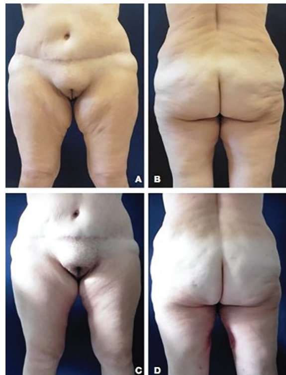
Fig. 4: (A-B) Anterior and posteriorview of this 52-year-old woman who underwent Liposuction Assisted Medial Thigh Lift after gastric bypass and weight loss of 50 kg. (C-D) Three months postoperatively. Note the location and the quality of the scar.