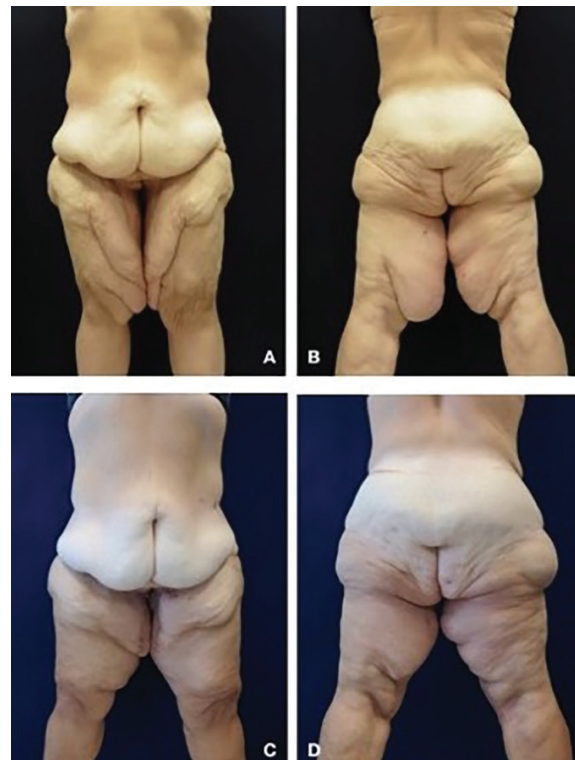
Fig. 3: (A-B) Anterior and posteriorview of this 50-year-old woman who underwent LAMeT after gastric bypass and weight loss of 80 kg. (C-D) Three months postoperatively. Skin excess had been removed with functional and aesthetic improvement.

Several studies have shown that liposuction preserves perforating vessels wider than 1 mm. Salgarello demonstrated how the perforating vessels of the deep inferior epigastric artery were equal in number, diameter and flow before and 6 months after liposuction. 18 Similar results