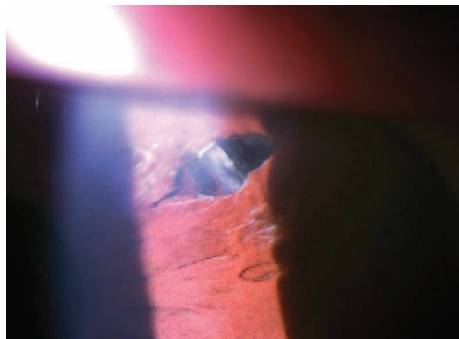
Fig. 2: Slit-lamp photograph showing the iridectomy opening during the relapse of the aqueous misdirection. Strands of vitreous obliterate the opening