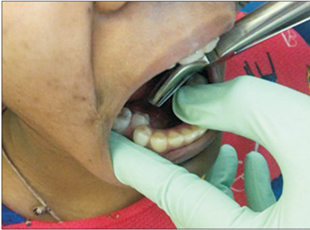
Fig. 2. Lingual approach using maxillary forcep.

Omkar Anand Shetye et al: Intra-alveolar extraction of linguoverte mandibular premolars – the Shetye technique: a technical note. J Korean Assoc Oral Maxillofac Surg 2022