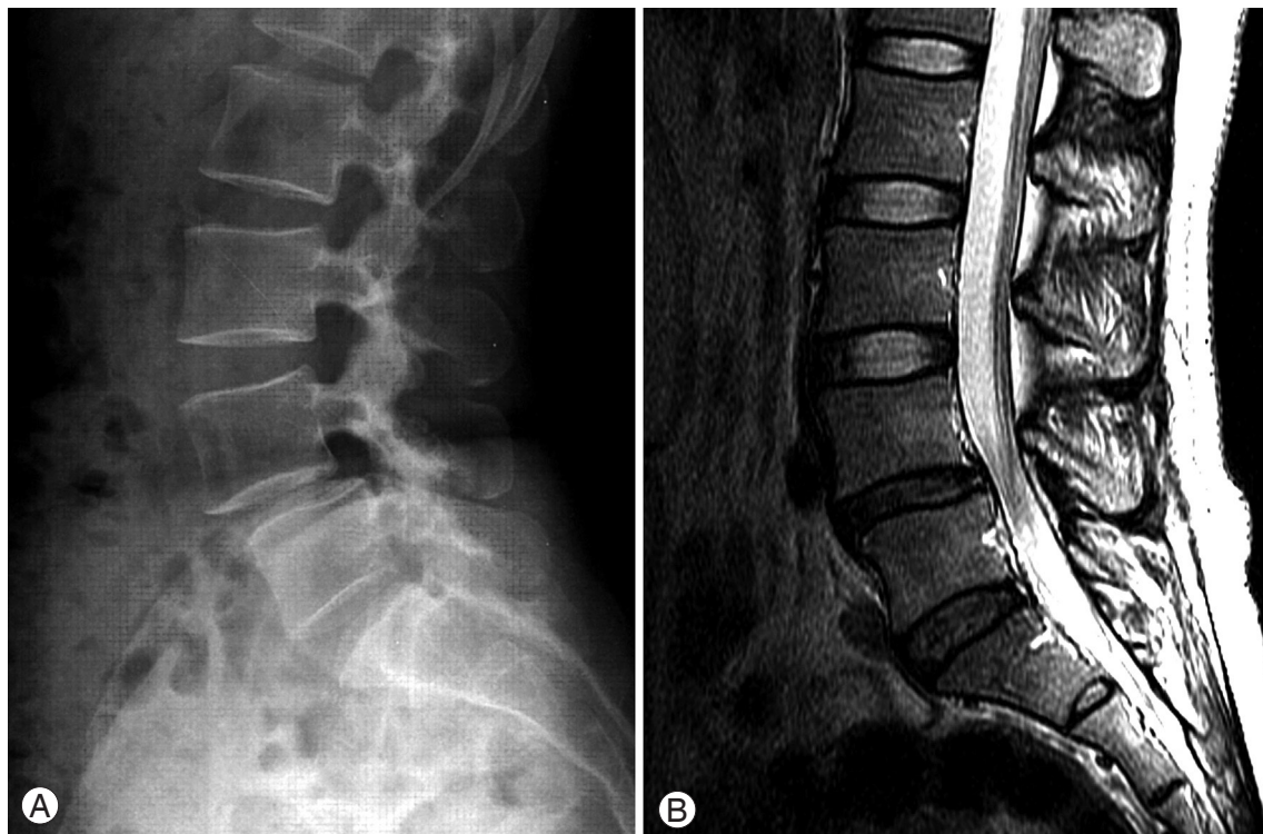
Fig. 1. A 36-year-old woman with L4-5 degenerative spondylolisthesis. (A) The preoperative neutral lateral radiograph demonstrates a 13.6% anterior translation. (B) On magnetic resonance imaging, the anterior translation is reduced to 2.3%.

fects to the segmental motion of the listhetic segment. The mean age of the patients was 59.6 years (range, 43 to 79 years); 27 were men and 110 were women. Ninety-three patients had degenerative spondylolisthesis and 44 had isthmic spondylolisthesis. The L3-4 segment was involved in 10 patients; L4-L5 in 101, and L5-S1 in 26. One hundred and twelve patients demonstrated grade I (less than 25% anterior slippage) and 25 patients demonstrated grade II (25-50% anterior slippage). The neutral anterior-posterior and lateral radiographs, and dynamic flexion-extension radiographs in the lateral decubitus position were checked in all patients. In addition, each patients MRI was studied for preoperative evaluation. Clinically, we reviewed the preoperative Visual analog scale (VAS) score for low back pain on the activity of daily living. To evaluate the degree of segmental instability of the listhetic segments, we measured the differences of the percentage of sagittal translation and the differences of the sagittal angulation between the flexion and extension radiographs. The difference of sagittal translation and sagittal angulation was checked three times by one orthopaedic surgeon. We used the average of the three values. Sagittal translation was measured using the methods described by White and Panjabi [7], and sagittal angulation was defined